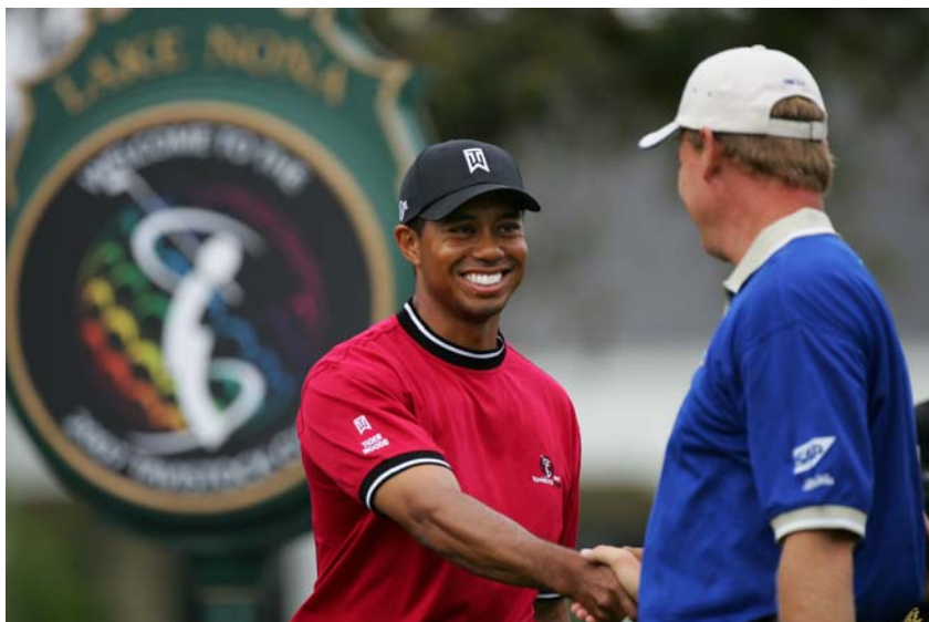
Tiger Woods and Ernie Els shake hands on Hole #1 at the 2007 Tavistock Cup.